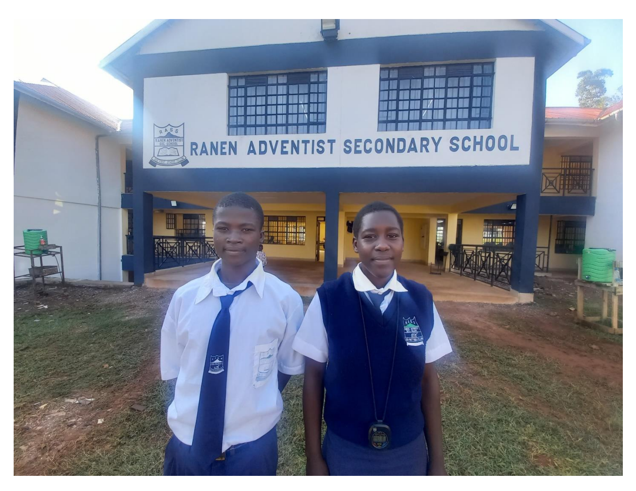
F1 needy but clever students being supported by RASS