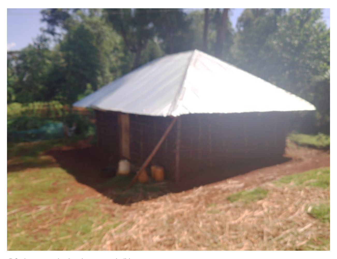
RC via communication department builds new house for Mzee Japheth Amala Muga . Amala comes from the neighborhood of Ranen Headquarters \,