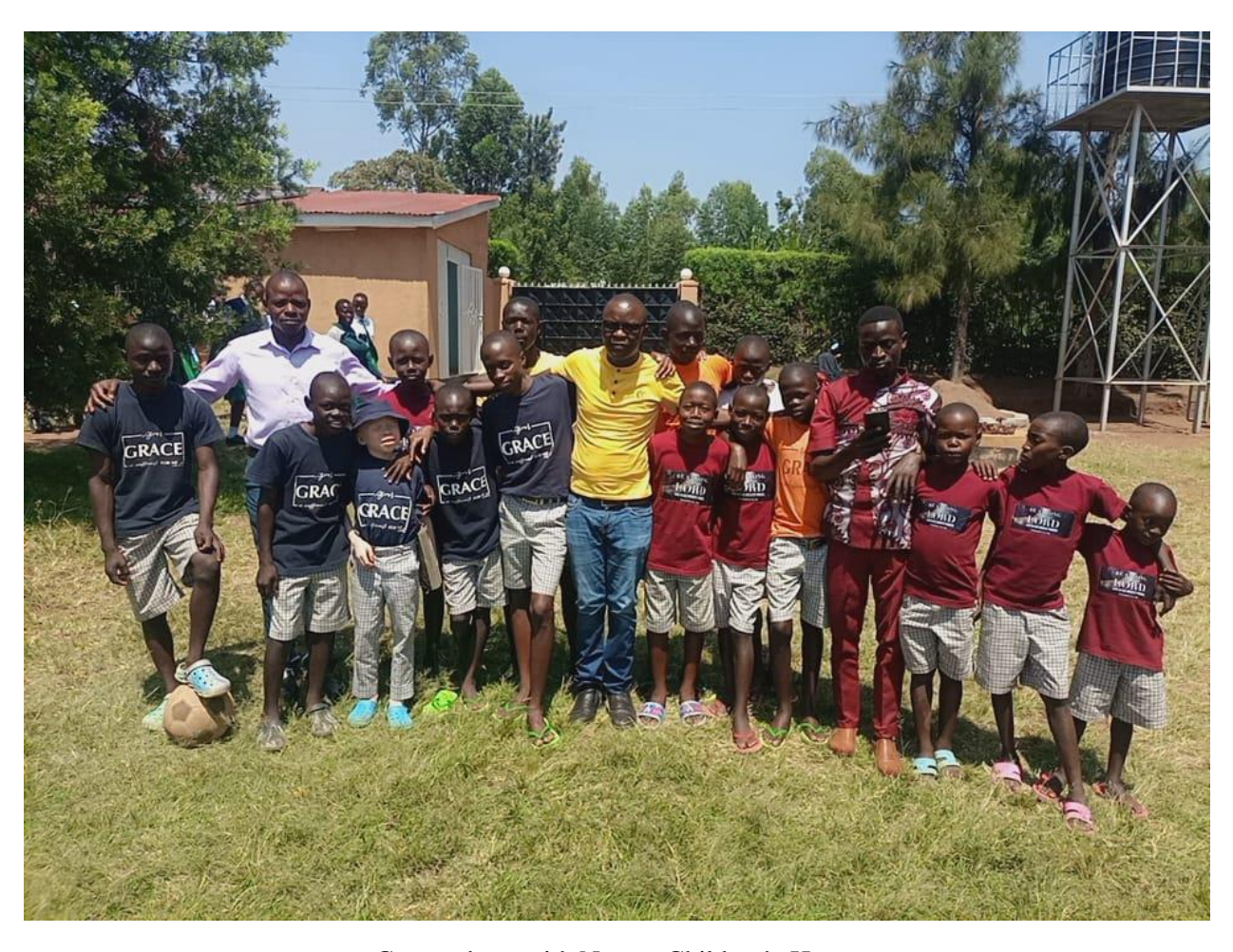
Group photo with Neema Children's Home