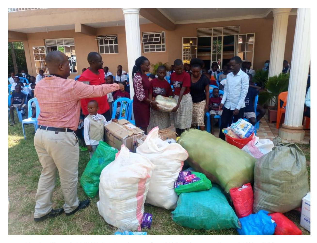
Food staff worth 1000 USA dollars Donated by RC Chaplaincy to Neema Children's Home