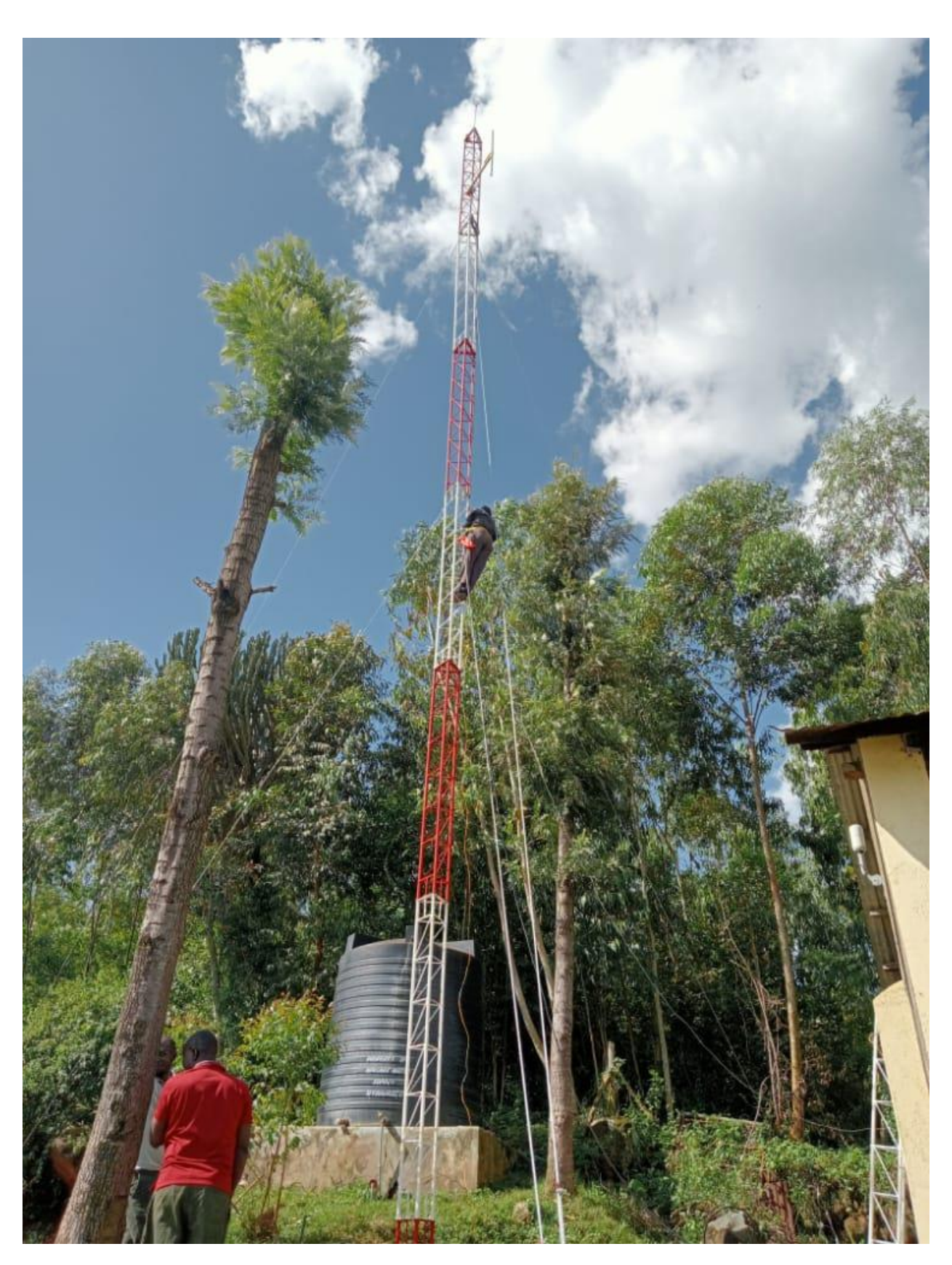
Onyalo radio mast construction in progress