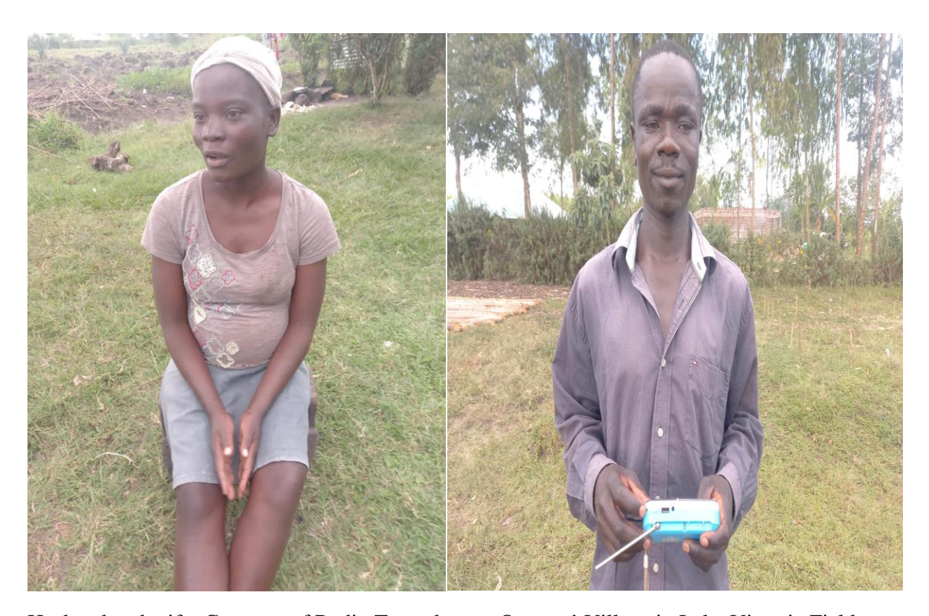
Husband and wife: Converts of Radio Tarumbeta at Ongeng' Village in Lake Victoria Field The couple was introduced to listen to the radio by a friend, a process that brought the two to church.