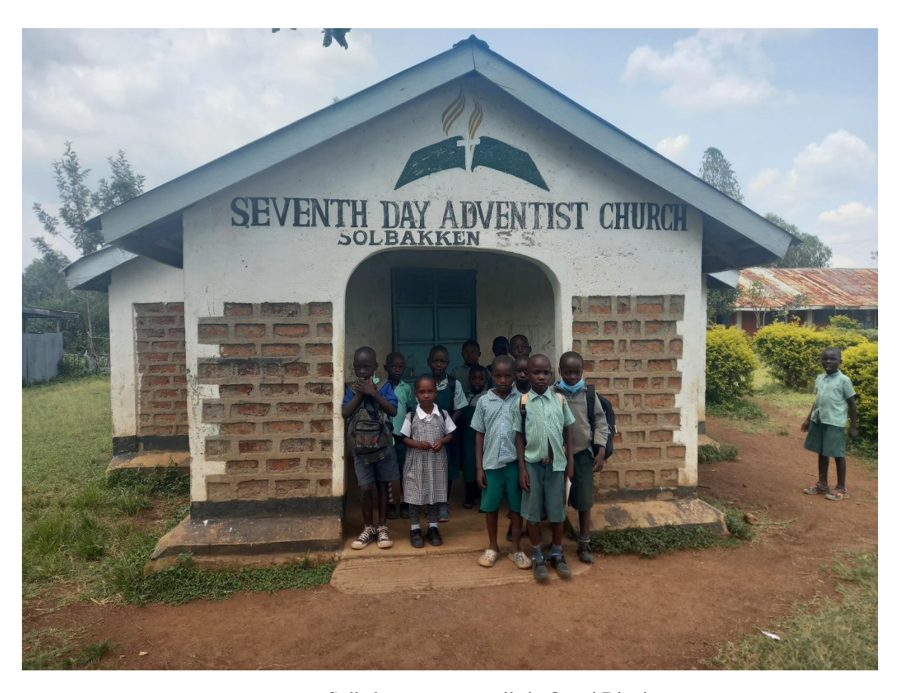
Solbaken nursery pupils in Oyani District