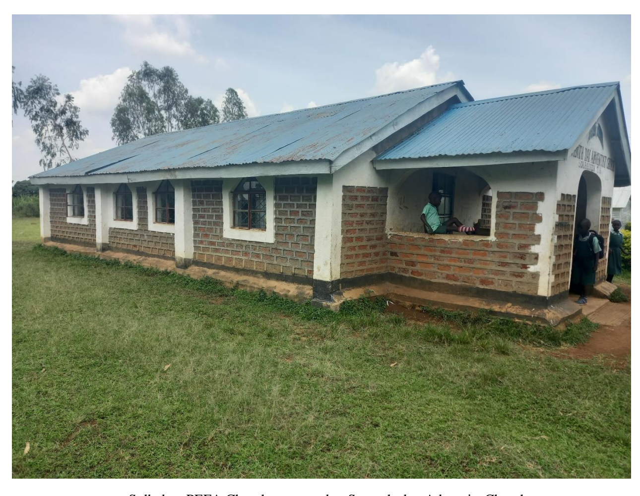
Solbaken PEFA Church converted to Seventh-day Adventist Church